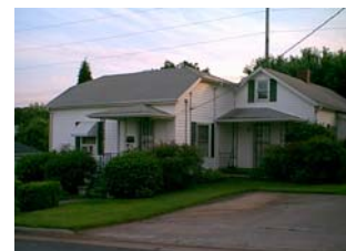
516 South Spring ~ circa 1880